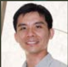
Prof. Shi-Wei Chu (NTU)

11/10 8:00 PM-9:00 PM (HOUSTON), 11/11 9:00 AM-10:00AM (TAIPEI)