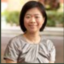
Prof. Ya-Ping Chiu (NTU)

10/27 8:00 PM-9:00 PM (HOUSTON), 10/28 9:00 AM-10:00AM (TAIPEI)